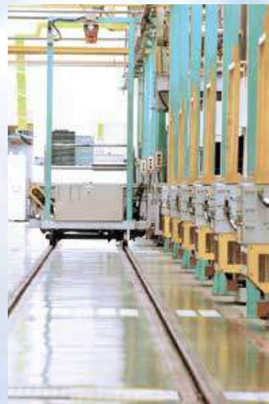
Automatic production system