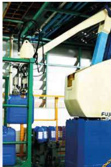
Container lifting robot